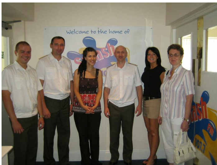
WITH THE STAFF OF SPLASH FM WHO DID A FABULOUS JOB, ESPECIALLY BEARING IN MIND THE LANGUAGE DIFFICULTY

Our guests helped promote the open day and work of the Trust with a visit to Splash FM. Our grateful thanks to all at Splash FM for the air time they so generously gave us.